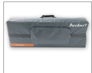
Bag for Ambu Airway Man